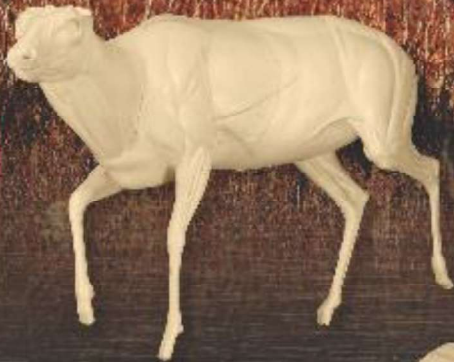
NEW! Whitetail Deer WTLS-468L