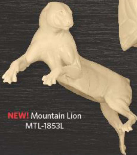
NEW! Mountain Lion MTL-1853L