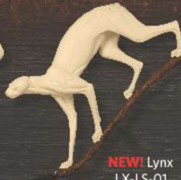
NEW! Lynx LX-LS-01