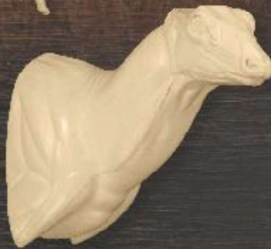
NEW! Axis Deer AX-SH-6119R